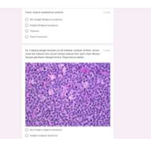
Figure 2. Display of topical exams using Google Forms