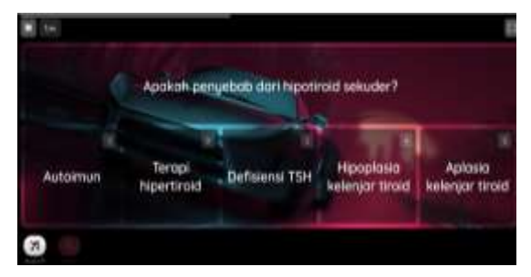
Figure 1. Display of exams using Quizizz

Students were also asked to fill out a questionnaire to determine the correlation between students' concentration, enjoyment, engagement, perception, motivation, and satisfaction when using Google Forms and Quizizz for remote testing. Students were also given an open question on which platform they believe is better able to achieve their desired learning outcomes.