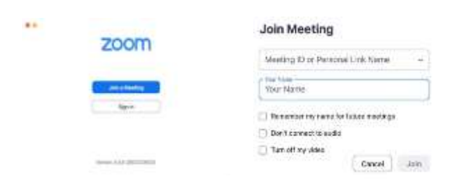
Figure 3. Cadet Zoom View to follow KBM

link or by entering the Meeting ID and Password